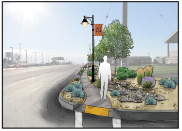
CONCEPTUAL RENDERINGS Design standards could include recommendations for elements such as building facades, Xeriscaping, and street lights.