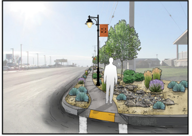
CONCEPTUAL RENDERINGS Design standards could include recommendations for elements such as building facades, Xeriscaping, and street lights.