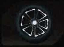
14" Color Matched Off Road Tire