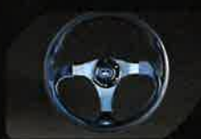
Luxury steering wheel

Turfman 800: 118"x 55" x 79" Cargo box: 43"x 46" x 11"