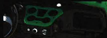
Color matched Dash with four cup holders/cell phone holder