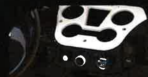
Color matched Dash with four cup holders/cell phone holder