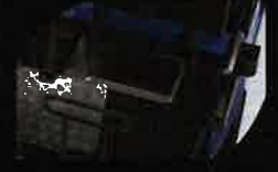
Plastic rear seat kit with storage & cup/cell phone holders