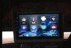
9 inch touchscreen with back-up camera