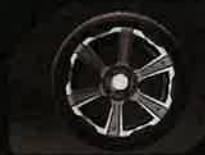
14" Alum Wheel with black insert/215/35R14 Radial DOT Tire