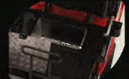
Plastic rear seat kit with storage & cup/cell phone holders