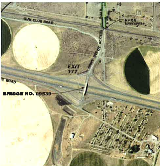
Exhibit 1 - I-84/Army Depot Access Road Interchange

The I-84/Army Depot Access Road interchange is located at Exit 177 in Umatilla County. The interchange is a traditional diamond-style interchange. The eastbound ramp terminal intersects Frontage Road/Ordnance Road while the westbound ramp terminal intersects the Umatilla Army Depot Access Road.